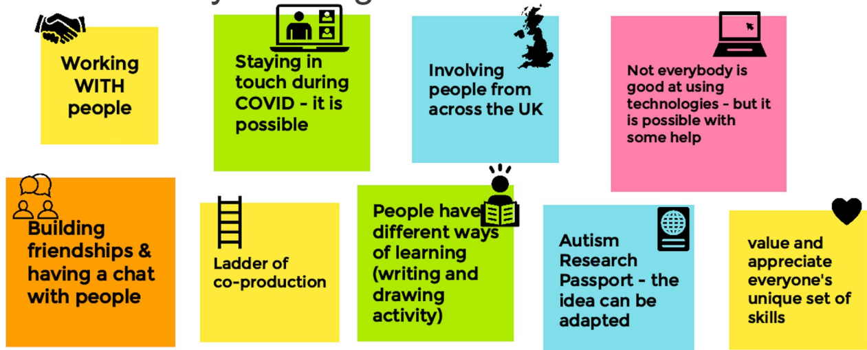
Fig. 3 Our shared key messages for the NCRM e-Festival developed on Google Jamboard.

unnecessary barriers, and with flexible time to cross, so everyone can access the bridge equally and walk at their own pace.