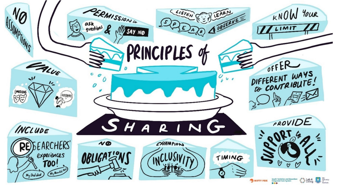
Fig. 3 Principles of sharing in PPI for Palliative Care

This paper reports the PPI conducted through the RE-EQUIPP Care Partnership. The aims of the project, to create opportunities, co-design new resources and propose a new framework for more equitable and inclusive PPI in palliative care research were met through a new collaborative partnership across primary care and palliative care in three areas of the UK. The project outputs and resources are intended to inform more equitable, diverse, and inclusive PPI for palliative care research in the future. Shared commitment to increasing diversity in PPI was necessary across the "hub and spokes" of the partnership. PPI members were recruited from both primary care and palliative care research networks, bringing together a group with diverse personal characteristics and experiences.