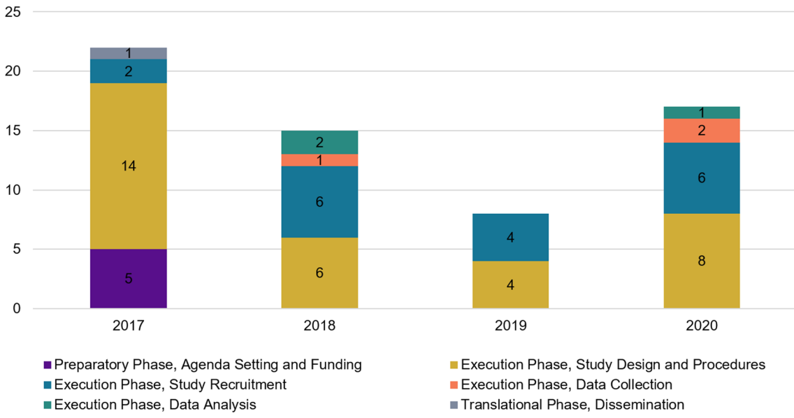
Fig. 2 Longitudinal breakdown of the number of SAC recommendations across meetings (by calendar year) and organized by Shippee et al. framework categories. *Data is not mutually exclusive and recommendations were coded in more than one category

representative of patients that come into the ED with lifelimiting illnesses.